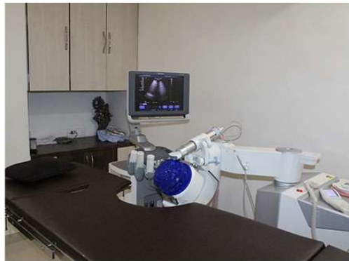
RAIPUR STONE CLINIC