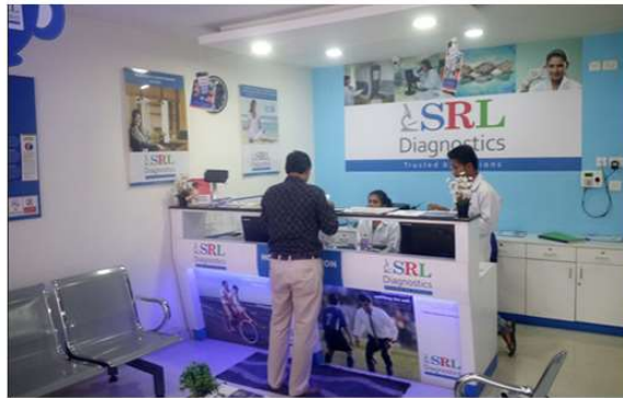
SRL DIAGNOSTICS, RAIPUR